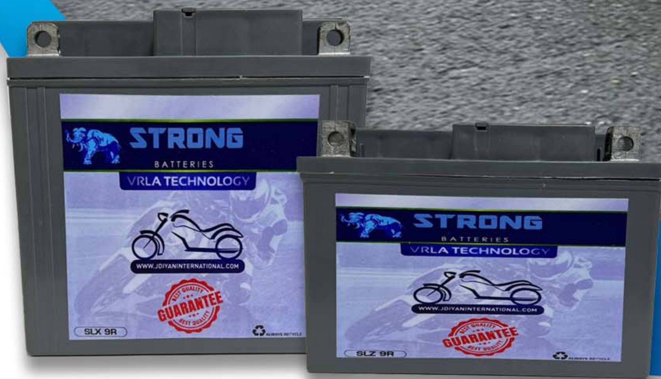
Motorcycle Batteries - platinum